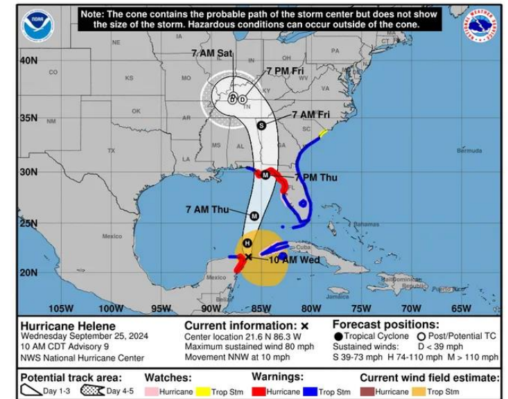
Hurricane Helene Model September 25, 2024

Non-Governmental/Community Organizations?